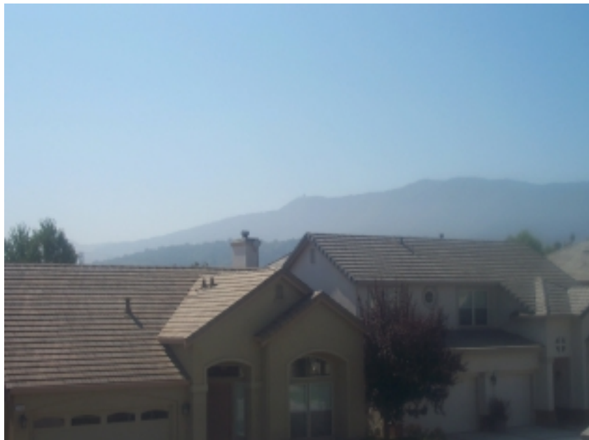
Mt. Umunhum as Seen From Chaumont Dr..

On Tuesday, a spokesman for U.S. Sen. Dianne Feinstein, D-Calif., said the senator, a member of the conference committee that will hammer out the defense budget, will push to include language in the final bill that would make Mount Umunhum a federal cleanup priority.